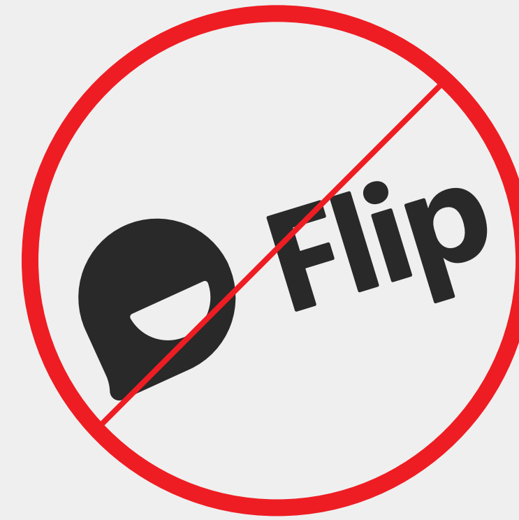
DON'T rotate the logo.