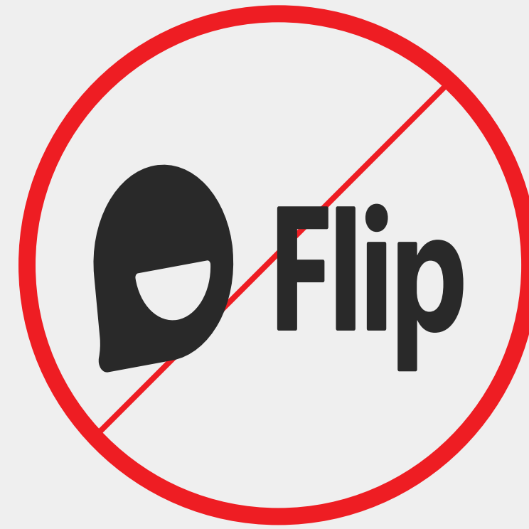
DON'T stretch or skew the logo.