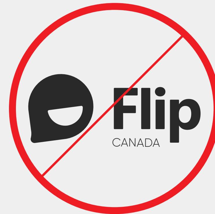
DON'T create new identities or icons based on the logo.