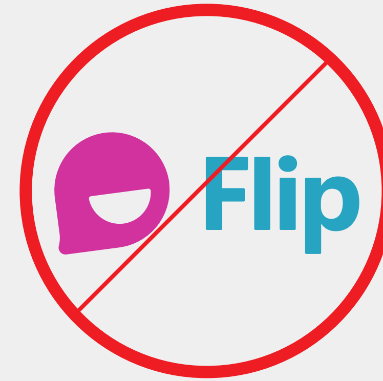
DON'T use colors outside of the brand palette.