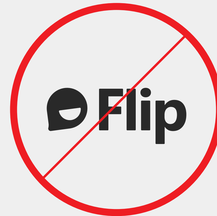
DON'T adjust the proportions of the logo components.