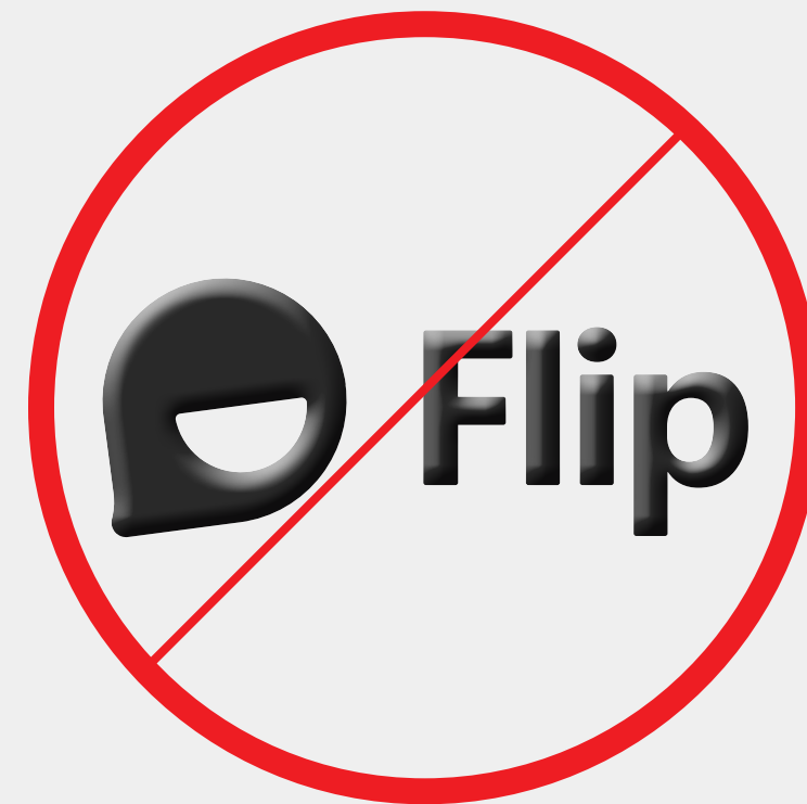
DON'T add special effects or shadows to the logo.