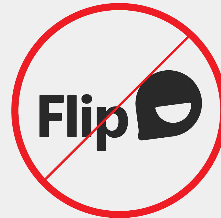
DON'T rearrange elements of the logo.